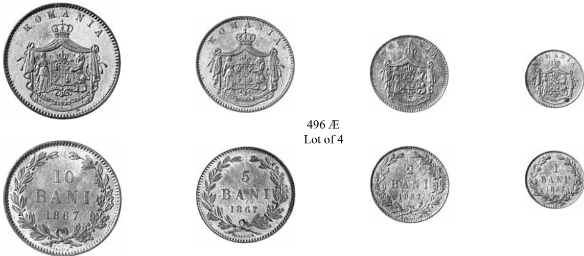
496 Æ Lot of 4