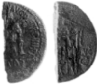
“Half Sestertius.”A Sestertius of 40-41 AD 13.45 gm.(Pietas seated /Caligula sacrificing before temple types)neatly cut in two to make change in ancient times.Cf.RIC 51.Deep blue-green with reddish earthen hues.Interesting. About VF