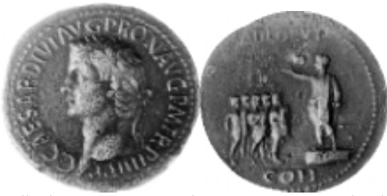
Caligula,37-41 AD.Sestertius,40-1 AD.Laureate head l./Caligula standing l.on platform,saluting five soldiers standing before him;ADLOCVT COH.Tan-yellow brown over some roughness.Nice broad flan. Good VF