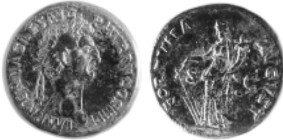
Nerva, 96-98 AD. Sestertius, 97 AD. 30.86 gm. Laureate bust r.; IMP NERVA CAES AVG PM TRP II COS III PP / Fortuna standing l. holding rudder and cornucopiae. RIC 98. Deep olive-brown. Nice portrait. Pleasing Choice VF

Quadrans. 2/85 gm. Modius with three ears of grain; IMP NERVA CAES AVG / Caduceus; S-C. RIC 112. Deep olive green-brown. Patina over light reverse deposits. Smoothing. VF