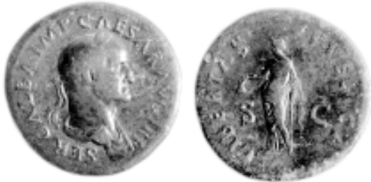
Galba, 68-69 AD. A Sestertius. 26.26 gm. Laur. bust r. / Libertas stg l.; LIBERTAS PVBLICA S.C. RIC 389. Deep brown. Good portrait. Smoothing VF

Vespasian, 69-79 AD. AE Sestertius, 71 AD. 24.69 gm. Rome or Lugdunum. Laur. bust r., IMP CAES VESPASIAN AVG PM TR P PP COS. / Pax stg l. w/ branch and cornucopiae; PAX AVGVSTI S.C. RIC 437. Deep green and yellow-brown VF