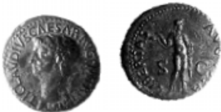
Claudius,41-54 AD. As.Bare head l./Liberitas standing,head r.,holding pileus.RIC 97.Rich glossy sea-green Choice VF 200.