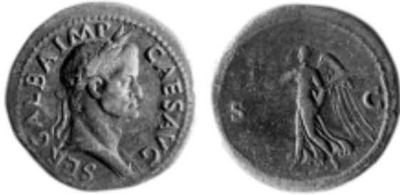
Galba, 68-69 AD. Sestertius, 68 AD. 26.07 gm. Laureate and draped bust r. / Victory striding l. holding palladium and palm, S-C. RIC 256. Strong portrait. Deep olive-green Good VF