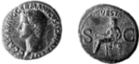
As.Bare head l./Vesta seated l.holding patera and scepter.RIC 38.Attractive deep olive-sea green.Pleasing portrait. Ancient scrape behind head toned over.Otherwise. Almost EF