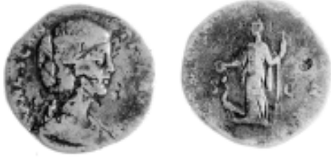
Manlia Scantilla, wife of Didius Julianus. Æ Sestertius. 20.03 gm. Draped bust r.; MANL SCANTILLA AVG. / Juno stg. l. with patera and scepter, peacock at her feet (reverse legend mostly off flan). RIC 19a. Very Rare. Some surface pitting and pocks. Clear type and obverse legend. Yellow-tan brown F