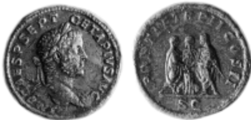
Geta, as Augustus, 209-211 AD. Sestertius, 210 AD. 28.59 gm. Laureate, bearded bust r. / Caracalla and Geta standing sacrificing over tripod, flute-player standing facing behind. RIC 156 (R2), Cohen 145. Pleasing burgundy-red-brown. Some tooling. Still attractive Good VF