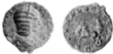
Julia Domna, AE As. Bust r./Luna in biga galloping l.; LVNA LVCIFERA S.C. RIC 600 (R2). Deep green patina with light earthen hues over light roughness. VF